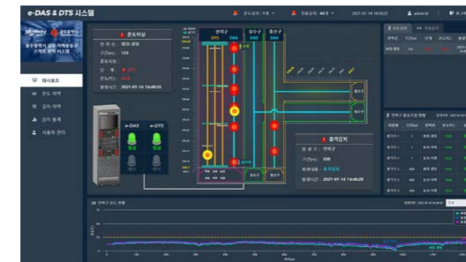
Gwangju Metropolitan City Underground Common District Smart Management System

POSCO Belt Conveyor Idle Roller Monitoring System This is a screen of the belt conveyor safety management monitoring system installed at POSCO Gwangyang Steel Works. The optical cable installed on the belt conveyor monitors abnormalities in the belt conveyor in real time, such as roller abnormality detection and raw material loading status.