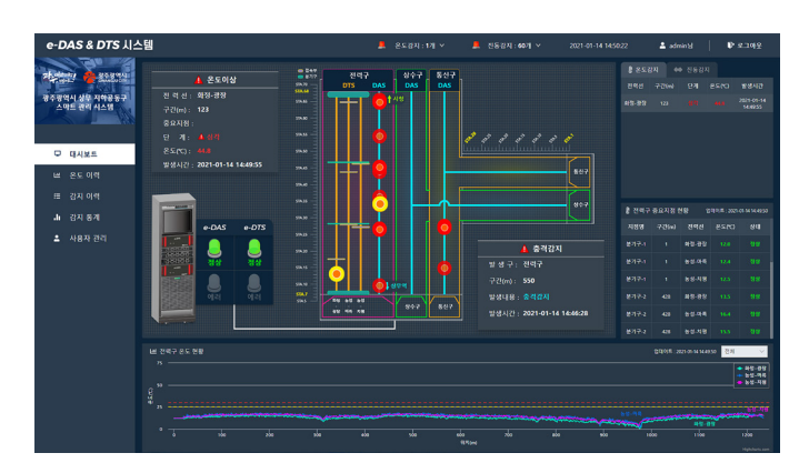
Gwangju Metropolitan City Underground Common District Smart Management System

This is a real example of ENITT e-DAS implementation.